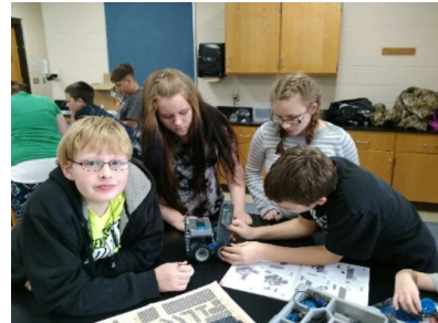
The 4-H After-School Robotics Club in Iosco County received a $1,000 Michigan 4-H Legacy Grant to use VEX Robotics as a tool to help club members develop life skills.

Learn more or apply online at http://mi4hfdtn.org/grants . Questions? Contact the Michigan 4-H Foundation at 517-353-6692.